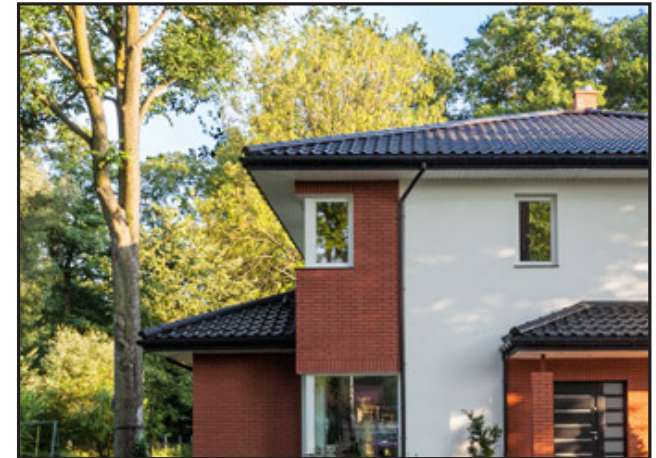
Tree trimming can prevent dangerous situations