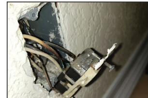
Hidden electrical issue