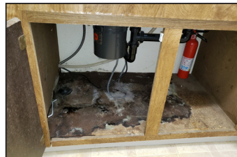
Water damage due to a leak