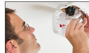
Replacing smoke detector battery